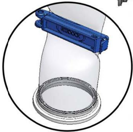
OPTIONAL POWDER CLIP

Flexible Connector Chutes are available in a range of sizes and materials